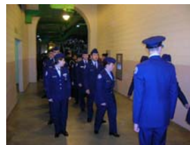
Marching for Inspection

This was their first competition of the year. Although they didn't win, they did compete well and learned a lot to prepare them for their next competition. There were over 60 Junior ROTC units competing from Air Force, Army, Navy, and Marine Corps JROTC units across several states in the eastern US.