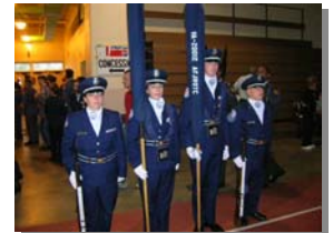
Chantilly JROTC Color Guard Team

The JROTC unit participated in a Drill Competition in Richmond, VA on 13 Jan 07. They competed in four categories; Unarmed Drill Team, Armed Drill Team, Color Guard, and Inspection.