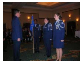
Cadet Change of Command Ceremony