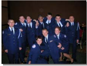
Cadets having fun!

Parents, guardians, and guests of the cadets were invited to this time-honored tradition in the military where members and guests meet socially at a formal dinner function to recognize individual and unit achievements. The cadets were honored with awards and ribbons earned during the first semester. Additionally, the outstanding flight, and second semester commanders were announced.