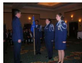
Cadet Change of Command Ceremony