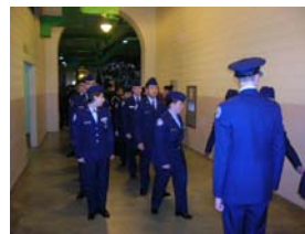
Marching for Inspection

This was their first competition of the year. Although they didn't win, they did compete well and learned a lot to prepare them for their next competition. There were over 60 Junior ROTC units competing from Air Force, Army, Navy, and Marine Corps JROTC units across several states in the eastern US.